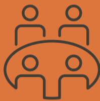
Nonprofits and NGOs