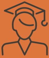
Schools & universities