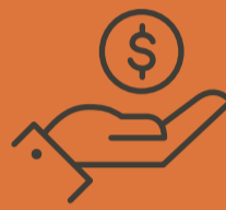
Corporations, foundations, & individual donors