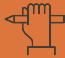
Teacher preparation programs